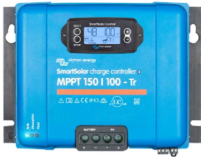
SmartSolar Charge Controller MPPT 150/100-Tr with optional pluggable display