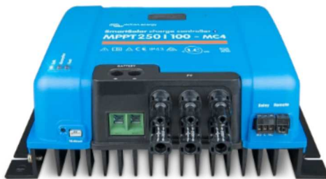
SmartSolar Charge Controller MPPT 150/100-MC4 without display